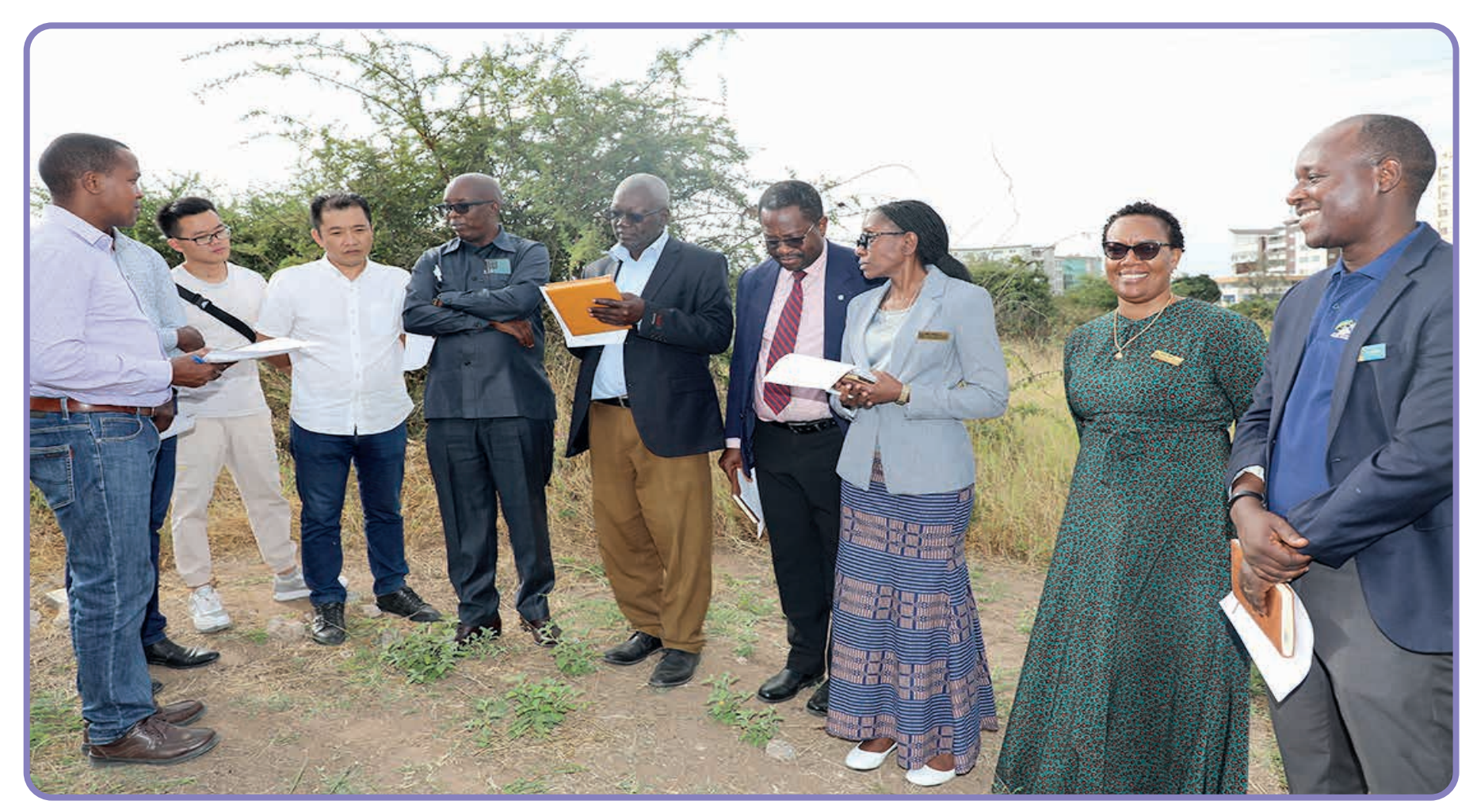
Members of the project team from PPRA, TBA and Hainan International Limited during handing over of the site.